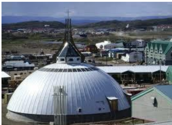
New Construction Above 2011