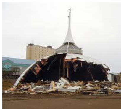
After the fire June 2006

It is only with the financial and prayer support of people like you that we will be able to see our project through to fruition. Once again, thank you so much for your kind contribution & support to this project.