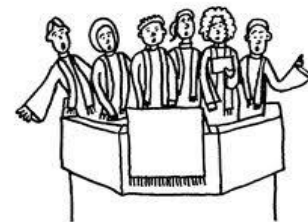
THE PREACHING COMPETITION

All Council Members will be happy to discuss any parish issues with you. Please contact the Church Office if you need a phone number or e-mail address to correspond with a member.